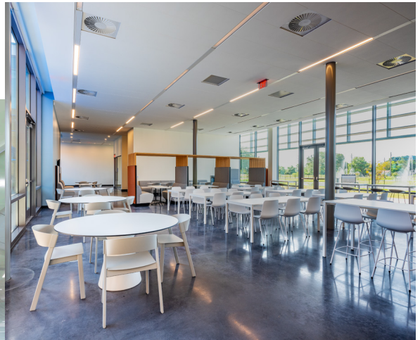
Project - Grundfos Brookshire, Texas, USA LEED Platinum Certification