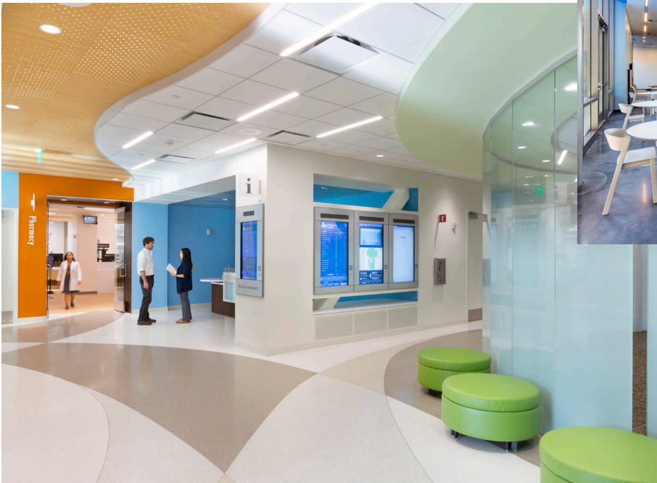
Project – Kaiser Permanente Mission Bay San Francisco, CA, USA LEED Gold Certification

Rockfon acoustic ceilings help deliver sustainable buildings and we are pursuing LEED v4 and v4.1 points for building interiors.