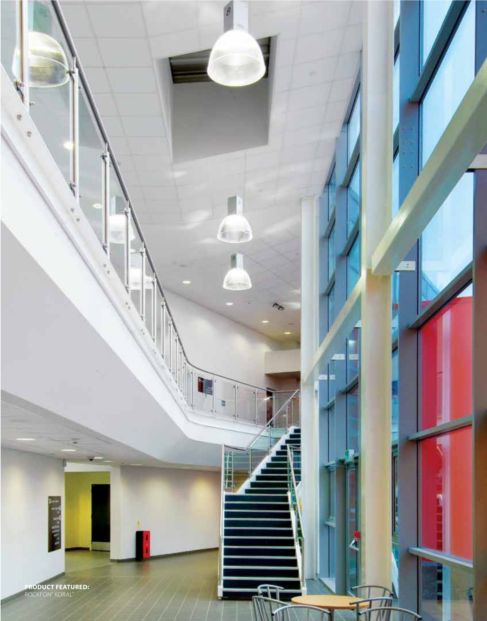
PRODUCT FEATURED: ROCKFON® KORAL™