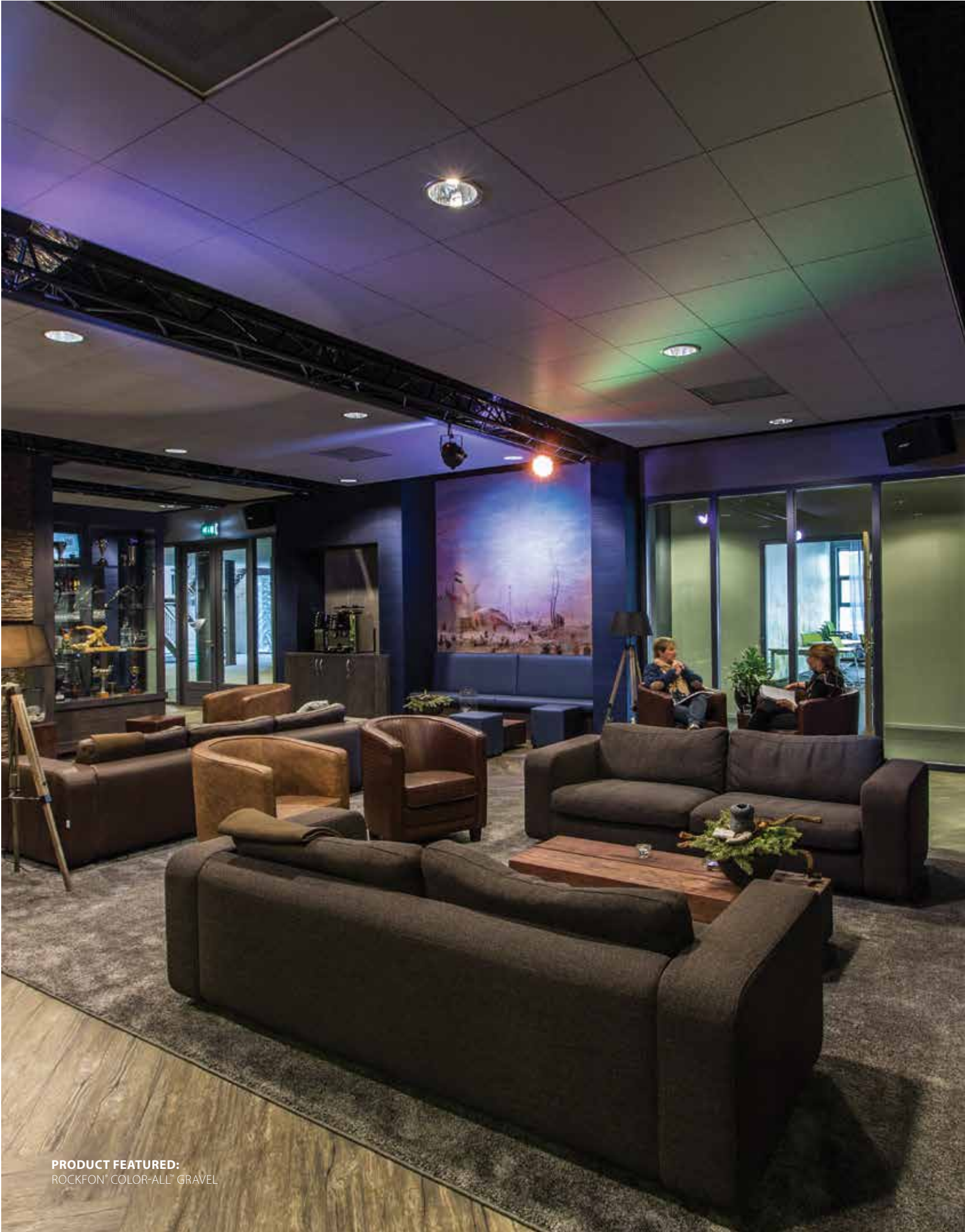
PRODUCT FEATURED: ROCKFON® COLOR-ALL™ GRAVEL