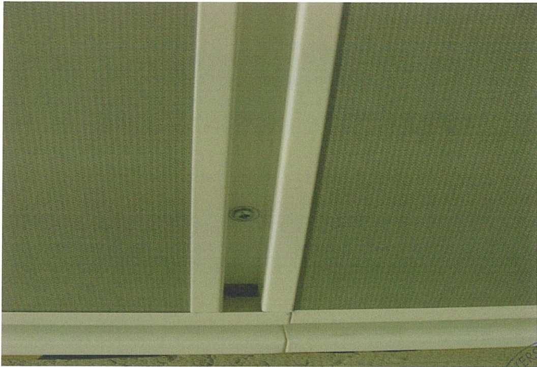
Photo 2 Tested elements detail: ceiling panels Rockfon VertiQ with Omega profile